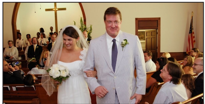
The Happy Couple