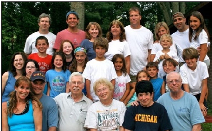
The Schindel Family