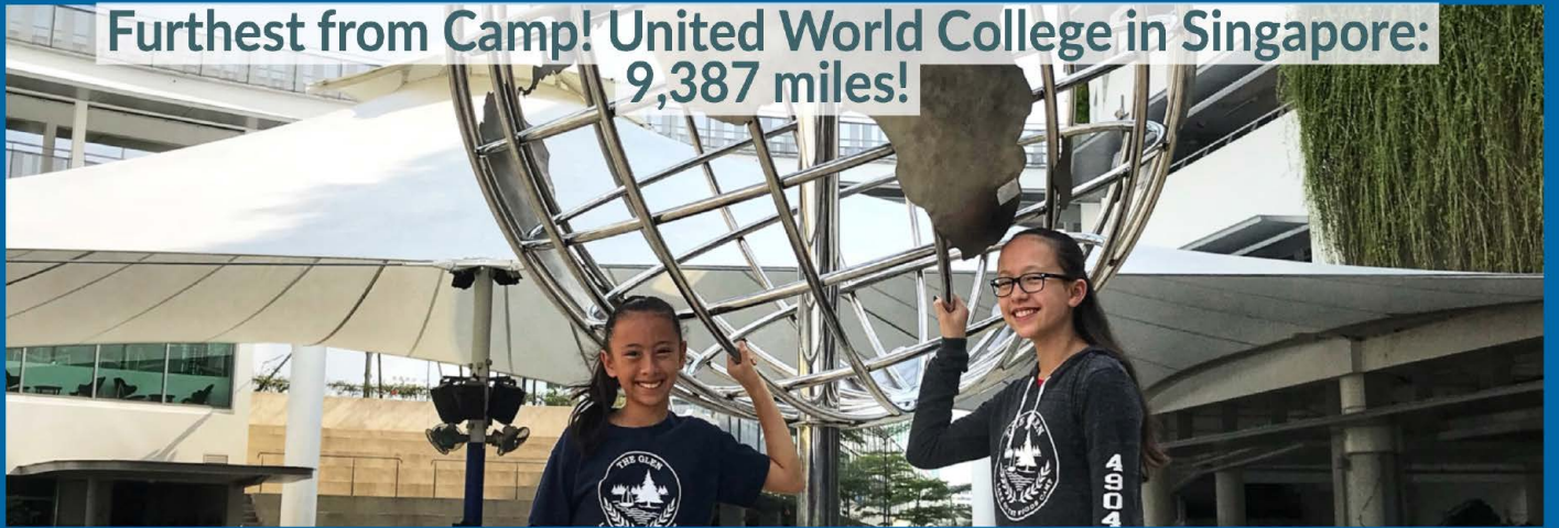
Furthest from Camp! United World College in Singapore: 9,387 miles!

Friday, March 2nd was our 7th ANNUAL GLOBAL CAMP APPAREL DAY! Campers, staff, and alumni participated by wearing their favorite camp gear. We are so proud of our entire camp family for sharing their enthusiasm and creativity in their camp spirit! Please visit the Lake of the Woods Family of Camps Facebook page to check out pictures of campers and counselors all over the world! Enjoy the winning photos!