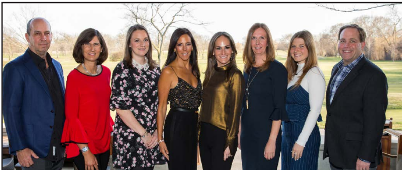
SCOPE MidWest Benefit Committee