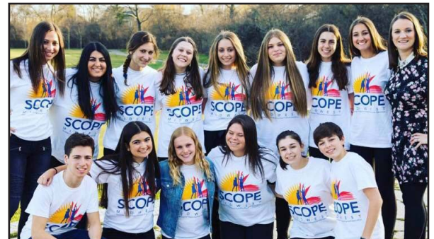
SCOPE MidWest Junior Leadership Committee