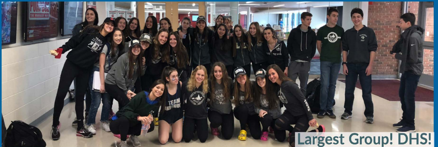
Largest Group! DHS!