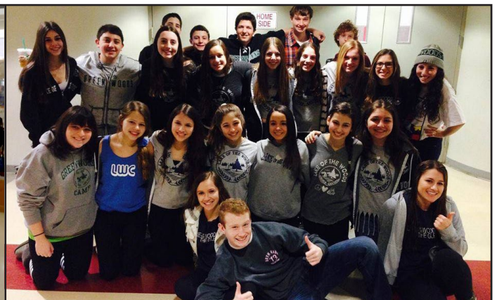
Largest group photo winner was a tie between "Highland Park High School" (left) and "Deerfield High School" with 24 campers in each.