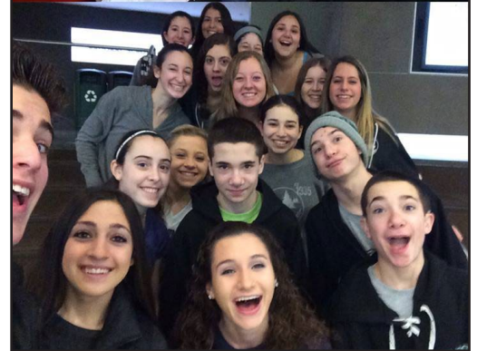
Most creative was won by "Stevenson High School" for the Oscars selfie.