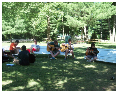
A guitar class meets at Circle in the afternoon.

Our newspaper class meets every A day. You can see us around camp, interviewing campers and staff, furiously jotting down notes, typing up stories, and taking photographs!