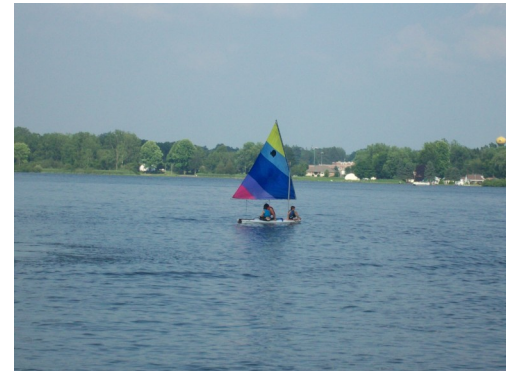
Campers hit the lake in a sailing class!

If you don't like one of your activities, then you should change it to community service to help out with the environment. If you haven't signed up for community service, you could still do your part and pick up your trash, finish your food, recycle, and take care of flowers and plants. You could also make things out of pop-tabs, paper, sticks and twigs, and even wrappers. One of the girls in Briar-gate makes bracelets out of pop-tabs and that is a great way to be creative and also help prevent pol-