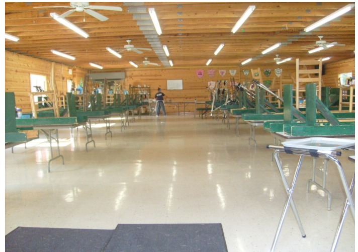
It takes a lot of work to set up the mess hall for each meal! Every day, different cabins help the kitchen staff set the tables for breakfast, lunch, and dinner, and every cabin is responsible for cleaning up their own table.

Laura's favorite mess hall breakfast is an English muffin, because she is English. Her favorite lunch is watermelon. Finally, Laura's favorite dinner is the salad bar.