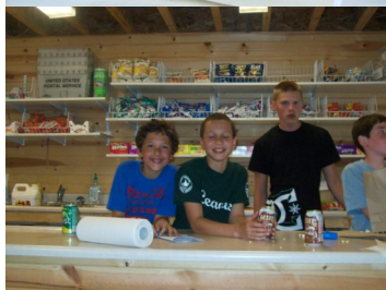
Campers enjoy craft and jewelry classes at Lake of the Woods while some Greenwoods campers hang out in the canteen!