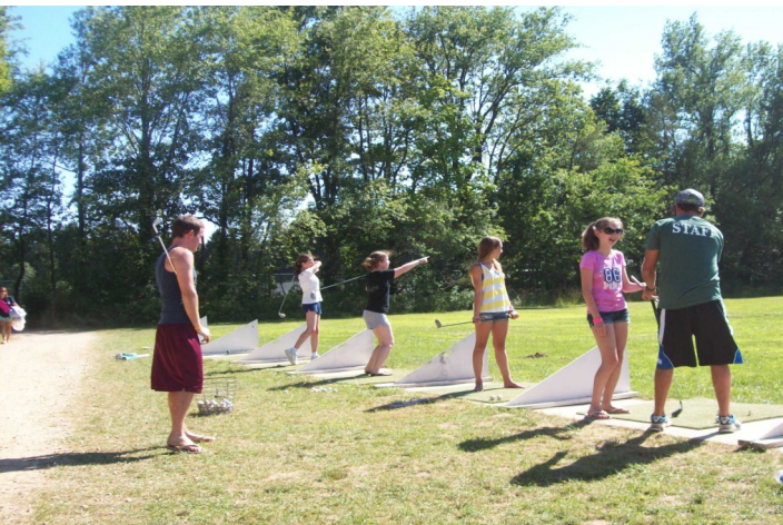
A golf class is hard at work in the sun.