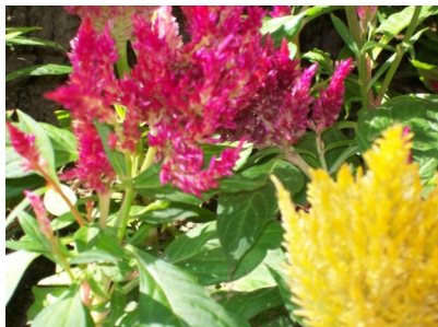
You can't beat summer in Michigan.

Check out Celia's fictional piece to learn how to put this survival guide to good use!