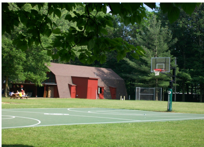
The Greenwoods Camp basketball court—a popular spot during rest hour!

The weather is really weird at camp. For example, one time it was storming at 7:51 then cleared up at 8:05. Then it was storming again at 8:22. It was really, really wet out side. After the storm, it was sunny for the whole day! When the weather is bad then you can not do some of the activities. It would be too wet and slippery to play soccer, for example, and you could not do any water activities in a storm. Luckily we have other options for rainy days! When it rains you go in your cabin or in Bob's Lodge! You can play games in there or watch a movie. You can also make a skit! It is really fun. When the weather clears up you can do your fun activities. Even though the weather is really weird, we still have fun!