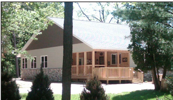
The new and improved Big House.

Our 77th summer in Decatur marked another filled with spirit, tradition and excitement! Our campers participated in many of the programs that many of us have loved during our camp days, including: The Bryn Mawr Show, trips to the Warren sand dunes, Olympic and Color Days, The Vassar Mock Trial, Capture the Flag and so much more.